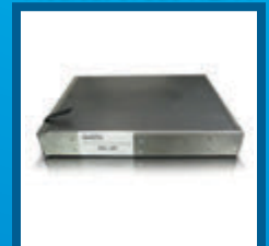
F033-GPC Chemical Filter