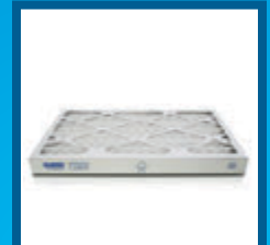
F007 Pleated Pre-filter