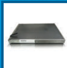
F045 Chemical Filter