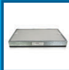
F022 Medical Grade HEPA