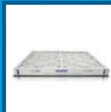
F265 Pleated Pre-filter