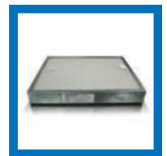
F074 Medical Grade HEPA