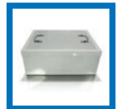
AG097 Chemical Filter