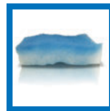
AG168 Knock-out Pad