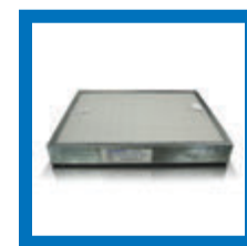
F074 Medical Grade HEPA