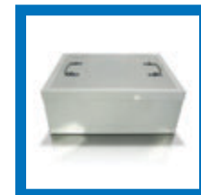
AG097 Chemical Filter