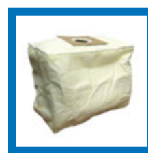
AG208-2 High Capacity Bag Filter