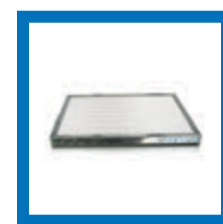
F191S Medical Grade HEPA