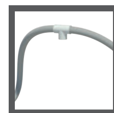
AA325 2-Station Upgrade Kit